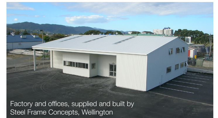
Factory and offices, supplied and built by Steel Frame Concepts, Wellington