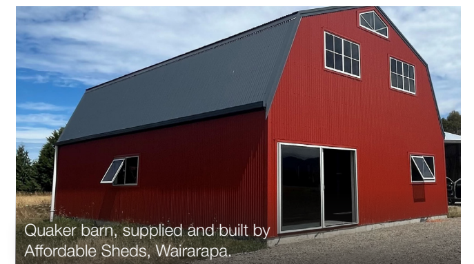
Quaker barn, supplied and built by Affordable Sheds, Wairarapa.