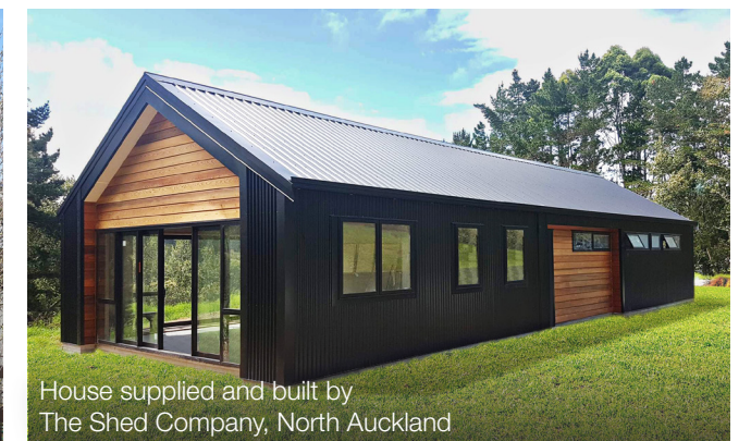
House supplied and built by The Shed Company, North Auckland