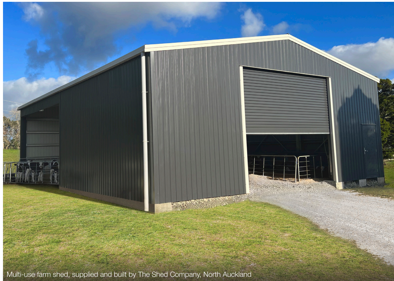
Multi-use farm shed, supplied and built by The Shed Company, North Auckland

All our buildings are fully engineered and certified to New Zealand standards, ensuring your peace of mind regarding structural integrity.