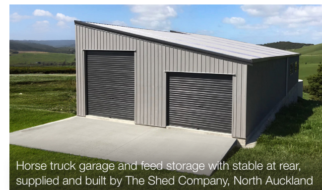
Horse truck garage and feed storage with stable at rear, supplied and built by The Shed Company, North Auckland