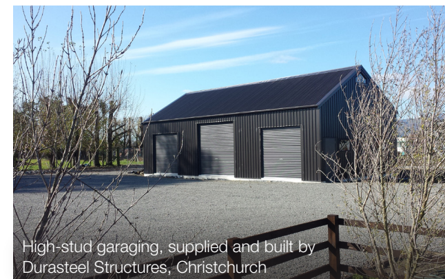
High-stud garaging, supplied and built by Durasteel Structures, Christchurch