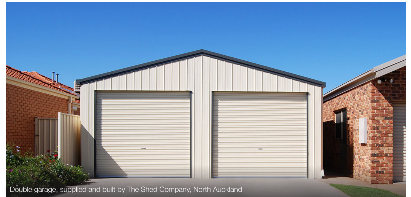
Double garage, supplied and built by The Shed Company, North Auckland