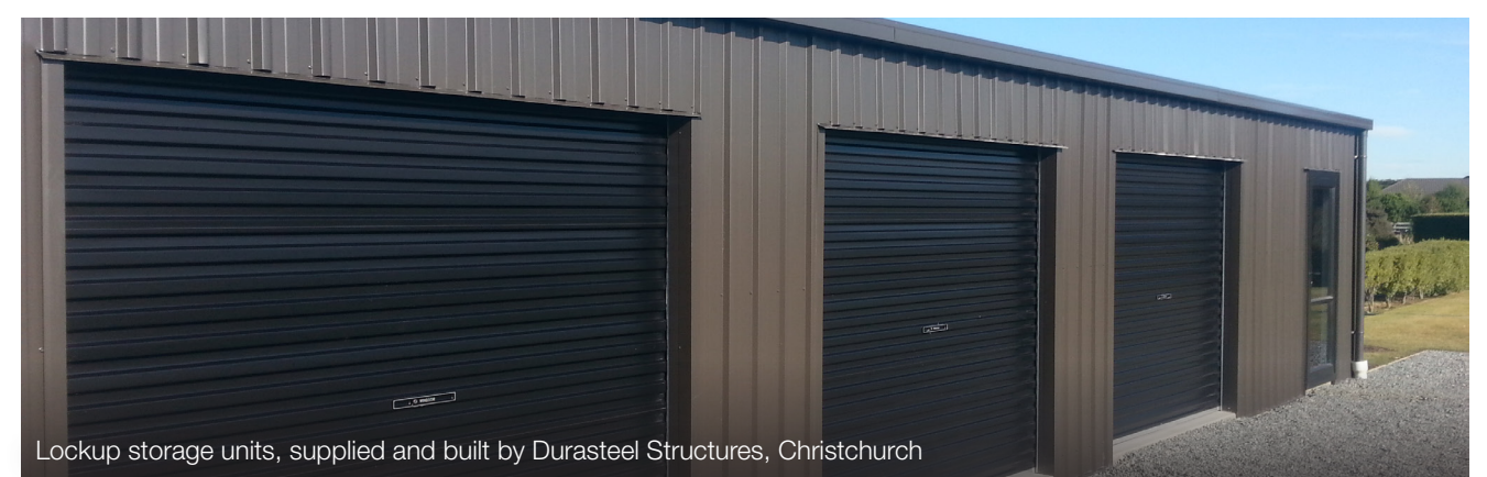
Lockup storage units, supplied and built by Durasteel Structures, Christchurch