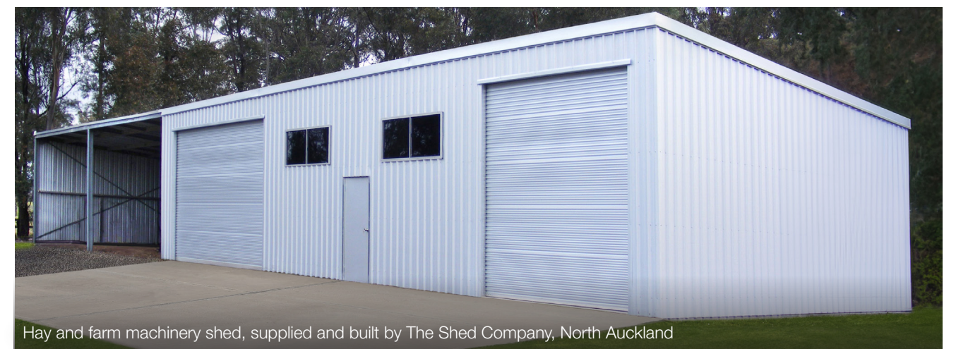
Hay and farm machinery shed, supplied and built by The Shed Company, North Auckland