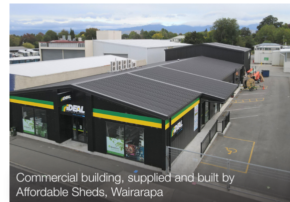
Commercial building, supplied and built by Affordable Sheds, Wairarapa