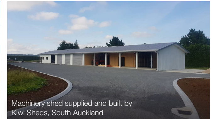
Machinery shed supplied and built by Kiwi Sheds, South Auckland