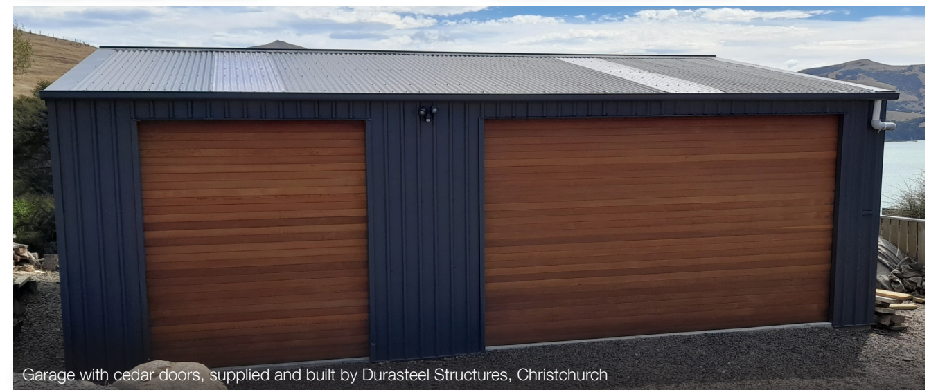
Garage with cedar doors, supplied and built by Durasteel Structures, Christchurch