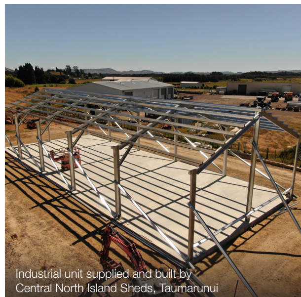
Industrial unit supplied and built by Central North Island Sheds, Taumarunui

From high winds to tail-wing height, wing spans, safety access requirements and chemical or materials storage – we think of everything. All of our designs go through ShedSafe's site check process. This ensures that the hangar's engineering is sound and will be fit-for-purpose for the hangar's specific location.