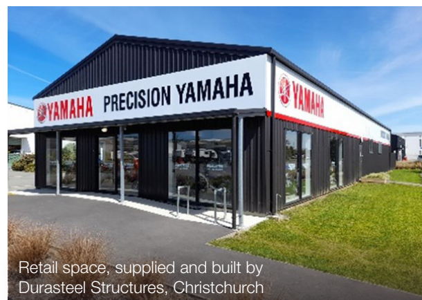
Retail space, supplied and built by Durasteel Structures, Christchurch