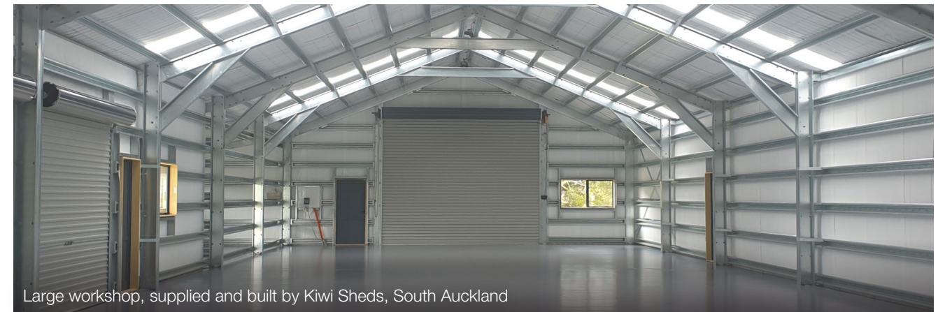
Large workshop, supplied and built by Kiwi Sheds, South Auckland