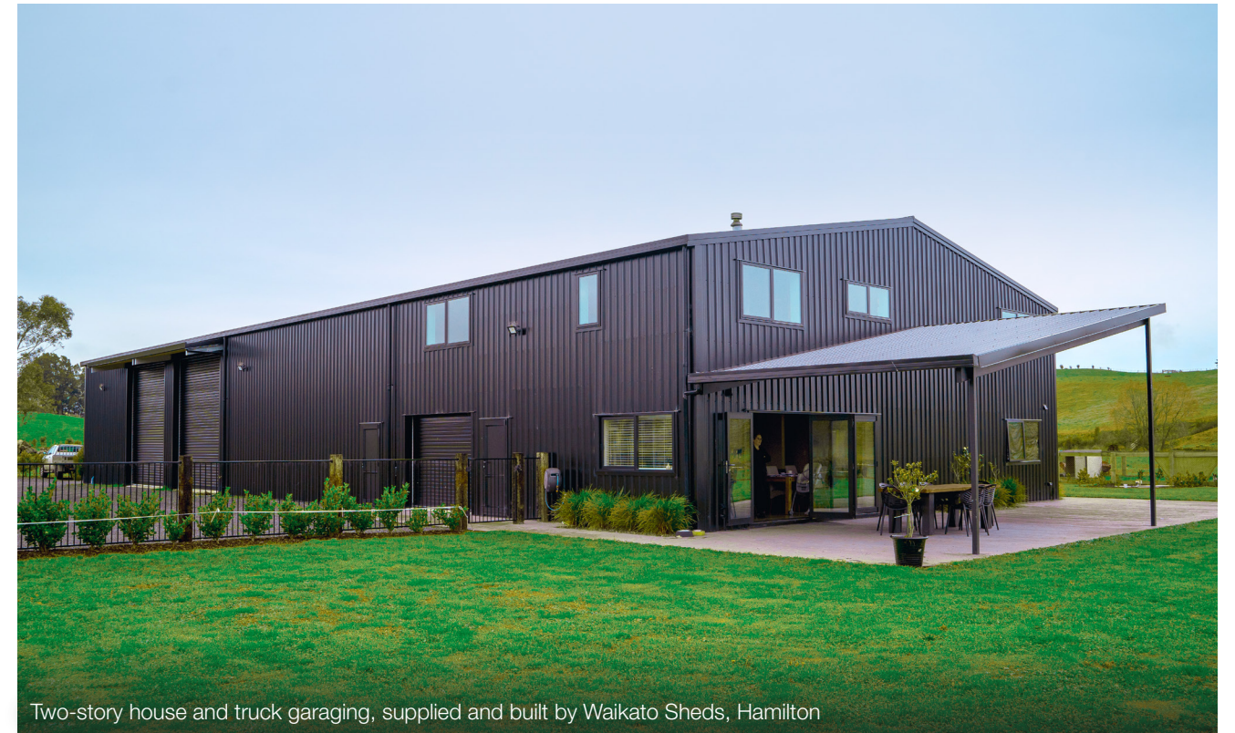
Two-story house and truck garaging, supplied and built by Waikato Sheds, Hamilton