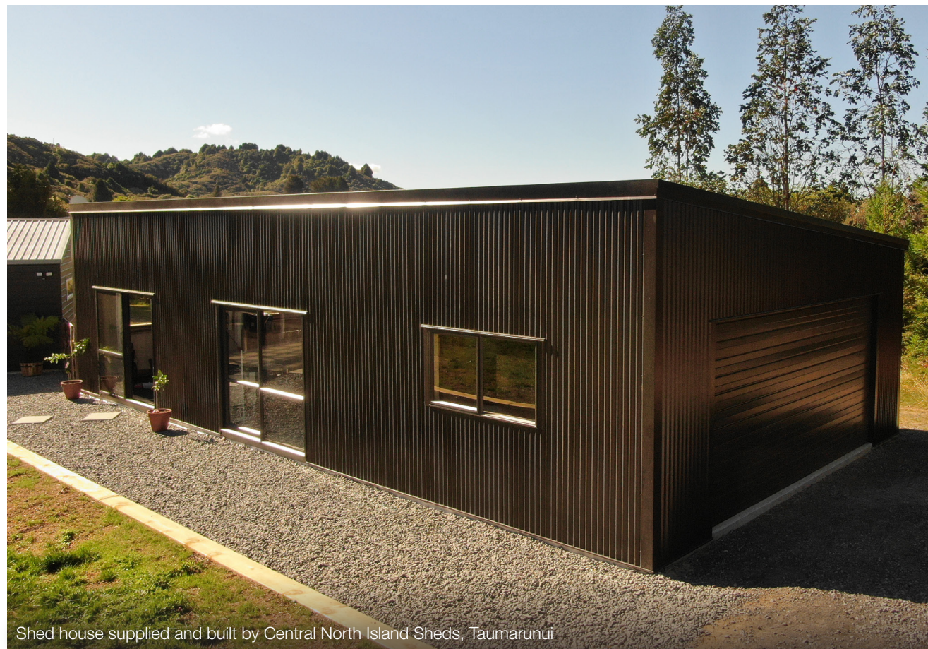
Shed house supplied and built by Central North Island Sheds, Taumarunui

We can even build your dream shed house.