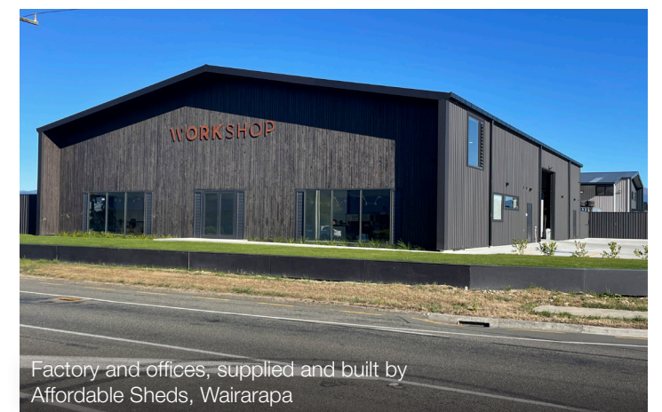
Factory and offices, supplied and built by Affordable Sheds, Wairarapa