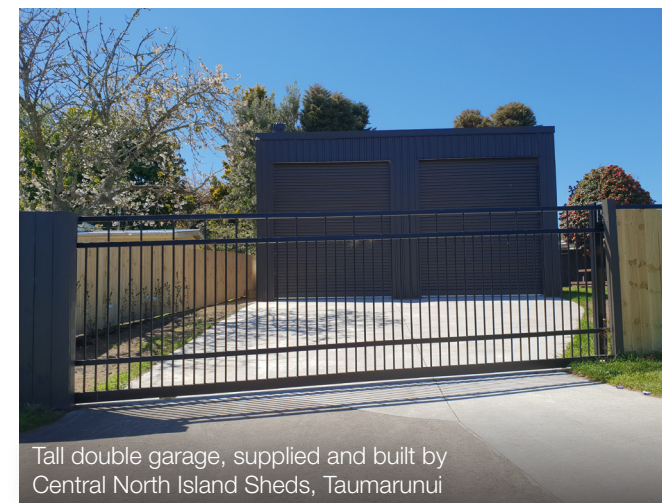
Tall double garage, supplied and built by Central North Island Sheds, Taumarunui