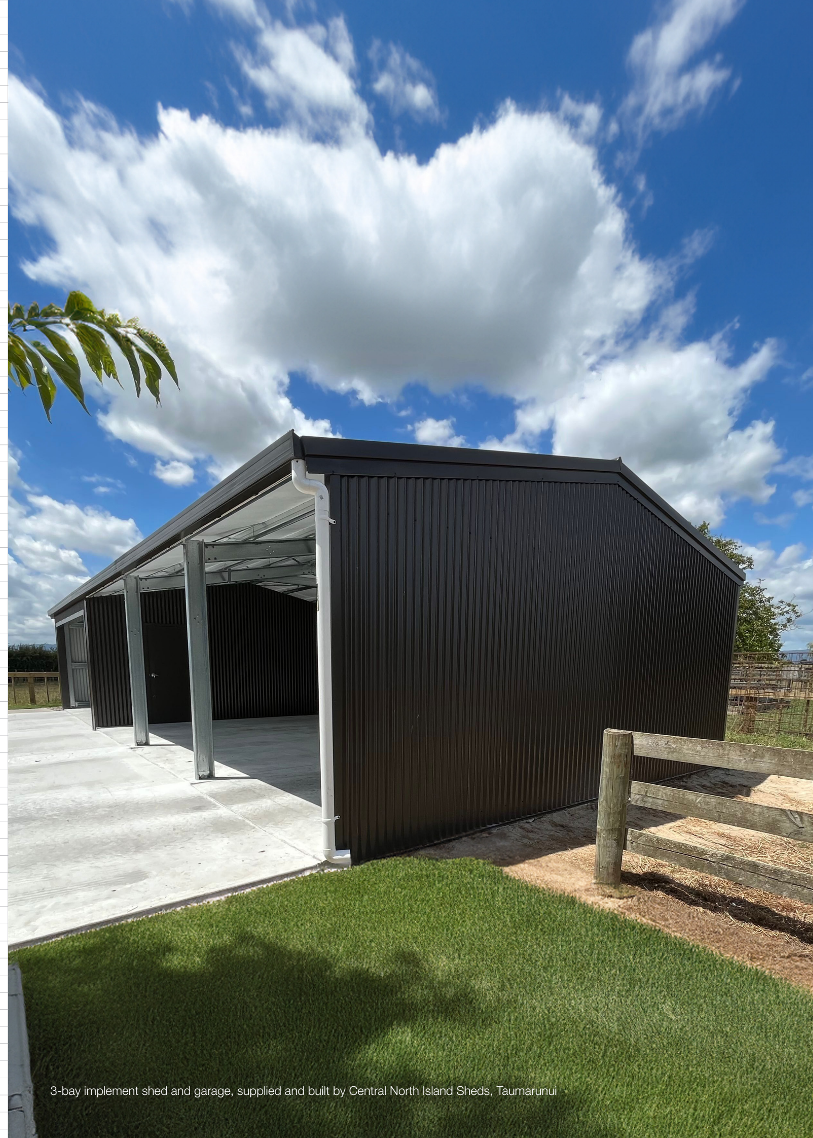
3-bay implement shed and garage, supplied and built by Central North Island Sheds, Taumarunui