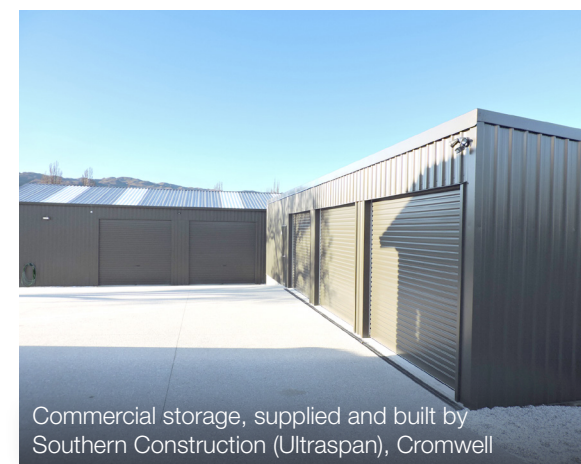
Commercial storage, supplied and built by Southern Construction (Ultraspan), Cromwell