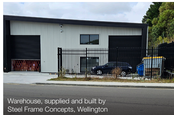
Warehouse, supplied and built by Steel Frame Concepts, Wellington