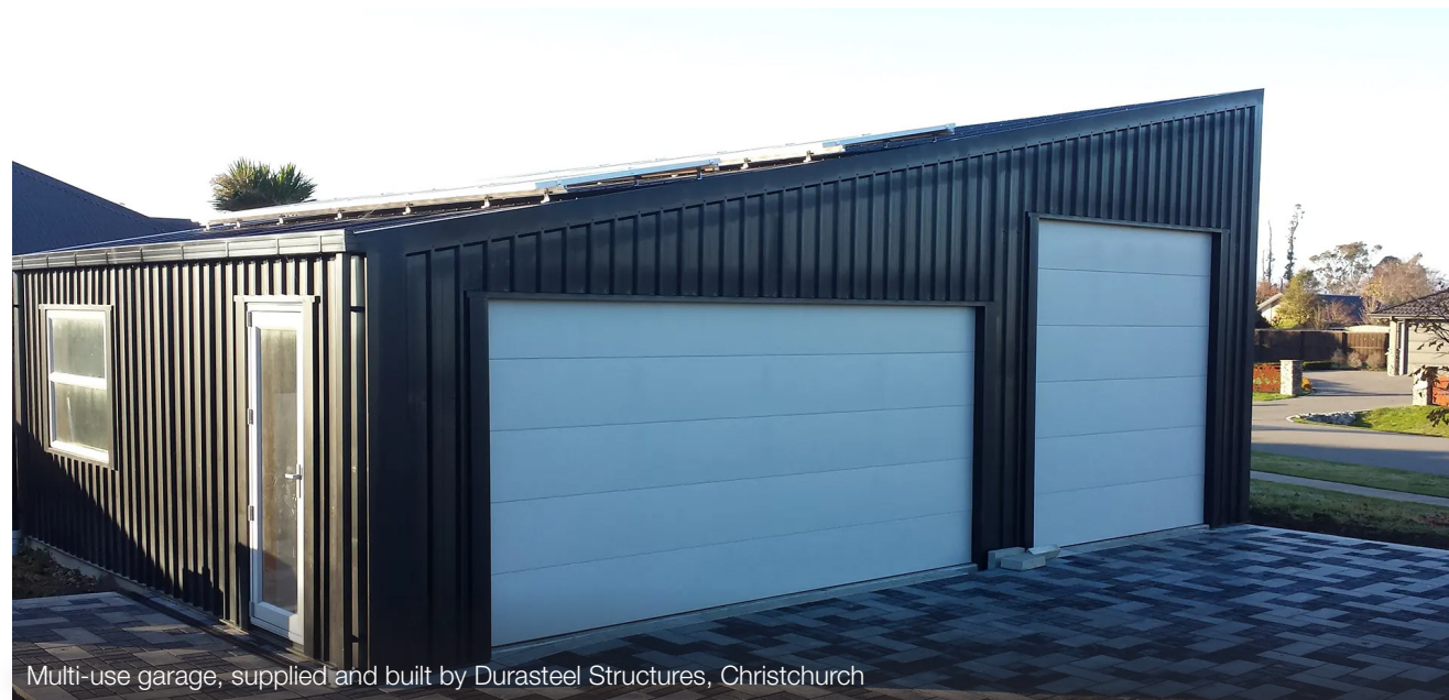
Multi-use garage, supplied and built by Durasteel Structures, Christchurch

Whatever your needs, we can design a building that takes care of your tools, gym equipment, vehicles, furniture – or just make it a really cool place to hang out.