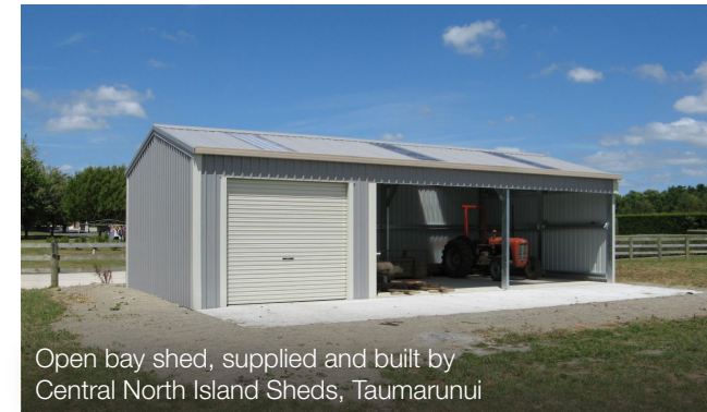
Open bay shed, supplied and built by Central North Island Sheds, Taumarunui