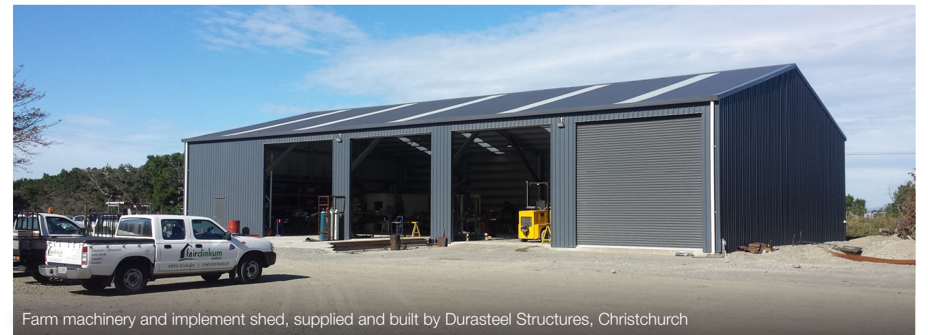
Farm machinery and implement shed, supplied and built by Durasteel Structures, Christchurch